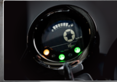
LCD Digital Meter