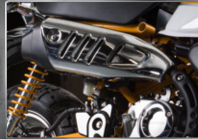
Never Lower Muffler