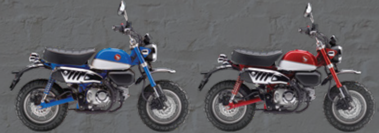
Pearl Glittering Blue