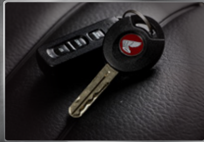
Alarm & Answer Back