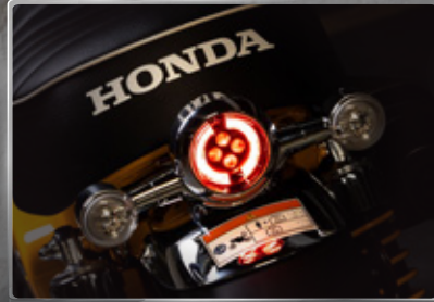
LED Taillight and Winker